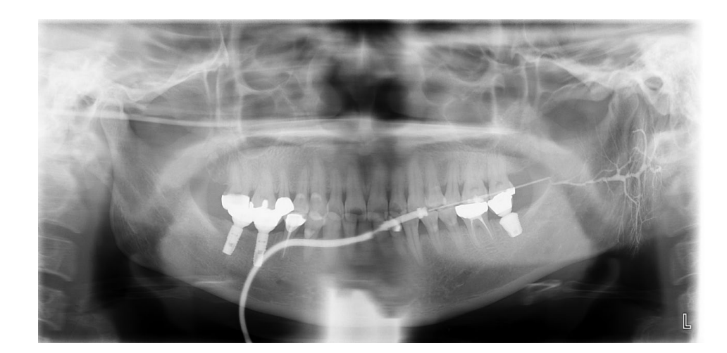
Fig. 3. Sialography of the left parotid gland in case 1 shows sialodochitis without sialadenitis. The Stensen duct exhibited dilatation with local strictures, and the intraglandular ductules showed irregular dilatation with constriction.