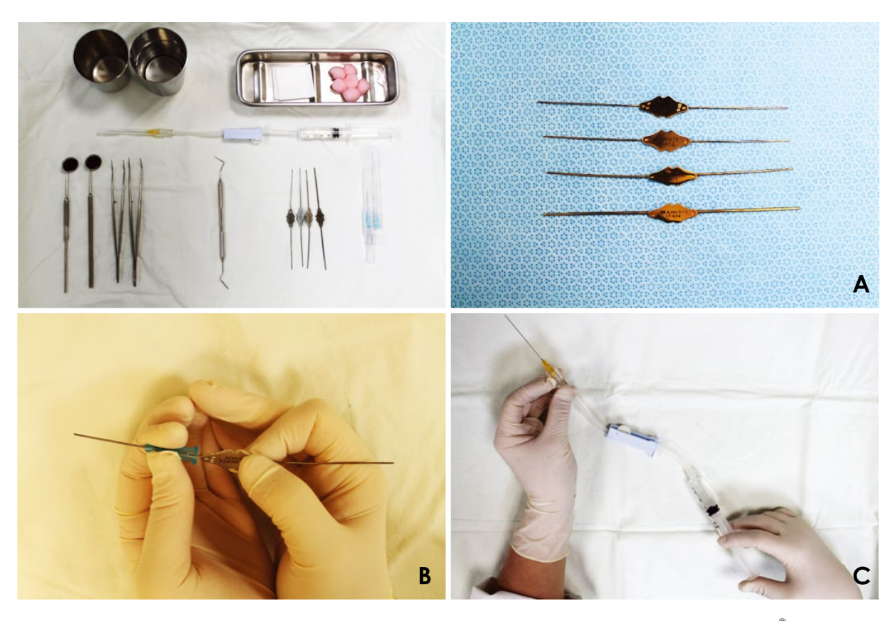
Fig. 1. Instruments used for power Doppler ultrasound-guided sialography. A. Lacrimal dilators (Bowman lacrimal probe<sup>®</sup>, #0.000 - #0.0). B. The plastic section of an intravenous catheter (20 G) with a lacrimal dilator. C. Universal cannula connected to a 5-mL syringe and intravenous infusion set.

The first step in the sialography process was to check the orifice of the parotid or submandibular gland. After the mucous membranes were dried with gauze, the parotid or submandibular gland was milked using a secretagogue such as lemon drops, and the orifice of the Stensen or Wharton duct was checked with a periodontal probe. Next, the main