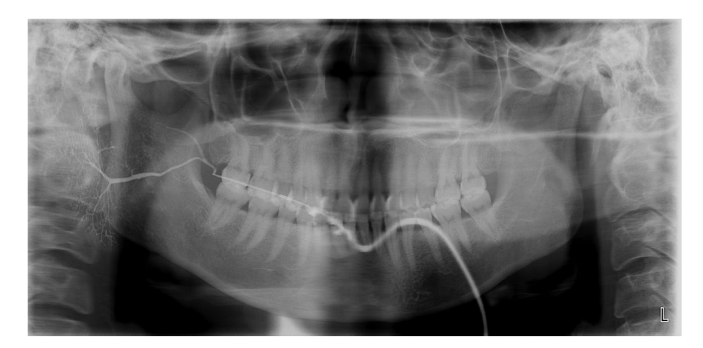
Fig. 5. Sialography shows atrophic changes in the ductal system of the right parotid gland, with narrowing of the secondary and tertiary ductules, but without sialectasis.

ment of oral medicine at a dental hospital with the complaint of a 6-month history of dry, burning mouth sensations. The symptoms were aggravated by brushing and spicy foods. However, an examination revealed no clinical signs of oral mucosal lesions such as mucosal damage, ulcers, or oral candidiasis. On preoperative power Doppler US images, no abnormal findings were observed (Fig. 4A). During sialography, the position of the catheter in the main duct was confirmed by a linear hyperechoic signal with posterior enhancement (Fig. 4B). After the contrast medium injection, the power Doppler US images revealed an increased blood flow in the salivary parenchyma (Figs. 4C and D). The patient was diagnosed with atrophic changes in the parotid ductal system on sialography (Fig. 5).