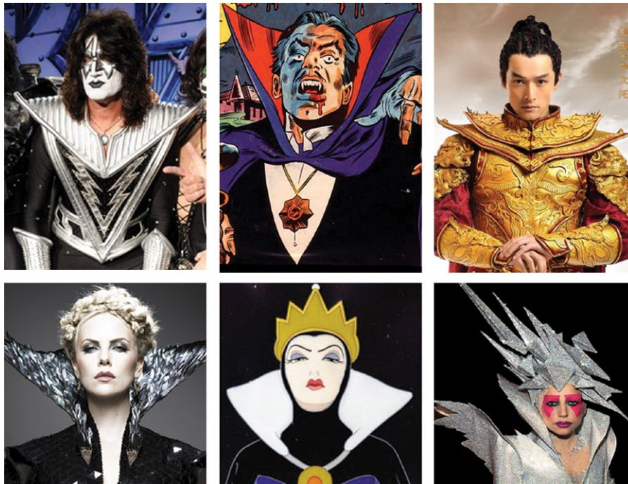
Figure 3. Downward-pointing triangles in our daily environment and multimedia content.