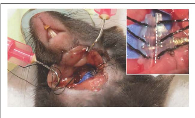
FIGURE 4 | Surgical preparation of the electrode implant. Close up (inset), where the white dotted line lies parallel to the nerve lying inside the cuff. All procedures described and animal photography was performed with approval by the Institutional Animal Care and Use Committee (IACUC) at the University of Miami.

the rubber encasement) and close the skin opening. Before closing the neck incision, place the animal back in a supine position to inspect the electrode and ensure the cuff is encircling the nerve without twisting or pulling. Close the incision on the neck. During surgery, care should be taken to avoid excessive manipulation of the nerve to prevent axonal damage, and, as has been reported, mechanical activation of neuroimmune reflexes (Huston et al., 2007).