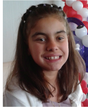
FIGURE 1: The facial photograph of the patient does not show any remarkable phenotypic features. Only slight facial dysmorphism could be observed: a long face with a prominent chin; broad forehead; and a broad, large mouth with widely spaced upper front teeth. Although not visible in this photograph, she has slightly protruding prominent ears.

Firstly, DNA was purified from peripheral blood according to standard protocols and a Perkin Elmer CGX Oligo Array 8x60K was used to perform genome-wide copy number analysis. This microarray covers over 245 cytogenetically relevant regions, as well as genes involved in development,