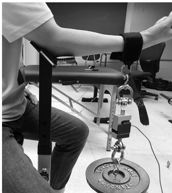
Figure 2. A demonstration of the elbow flexion position task.

The force produced during all the maximal and submaximal elbow flexion isometric contractions was detected by the tension applied to a force transducer (Model SM-500; Interface, Scottsdale, AZ). The maximal isometric contractions were performed to set the required force during the sustained task (elbow flexion) and to normalize EMG (elbow flexion and extension). Specifically, the isometric strength force was quantified from the highest 1-sec