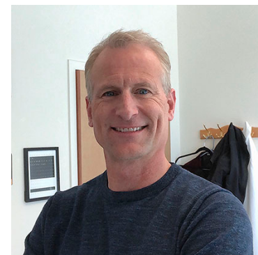
Insights from Ross Kedl.

To the question of the stability of anti-SARS-CoV-2 serology, the authors found different answers depending on what aspect of the serology was measured. As in previous reports, N-specific antibodies declined over time, though initial titers were generally robust and correlated well with a surrogate assay for determining neutralization capacity. Importantly, not