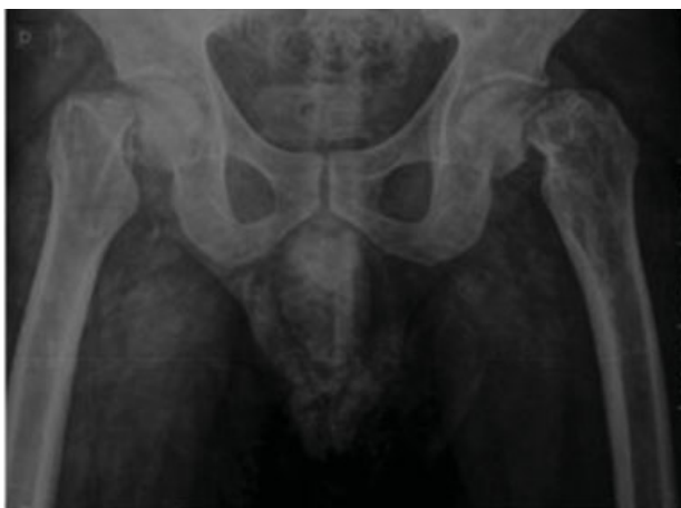
Fig. 1 Anteroposterior radiograph of the preoperative pelvis.

Patients with epilepsy present two to six times higher risk of fractures than the general population, whether from falls or seizures. 4 Antiepileptic drug use is associated with decreased bone mineral density and increased risk of fractures. 4,5 Middle-aged men with poorly controlled epilepsy are the patients most subject to post-seizure fractures due to more developed musculature. 5 In the case presented, it is believed that the cause of the fracture was multifactorial, due to osteopathy secondary to