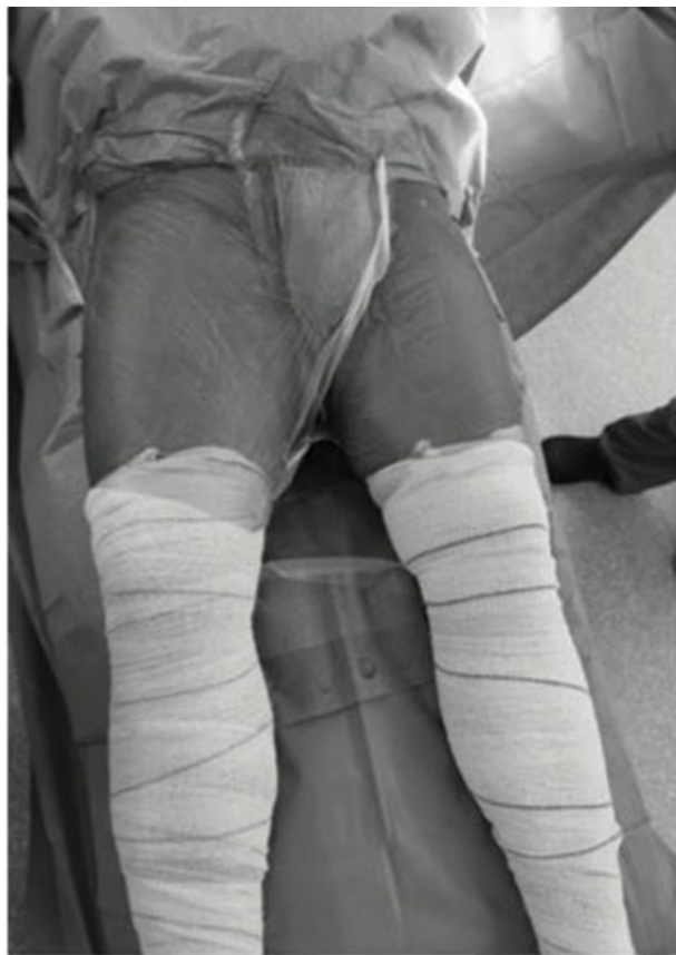
Fig. 3 Patient Positioning and Preparation.