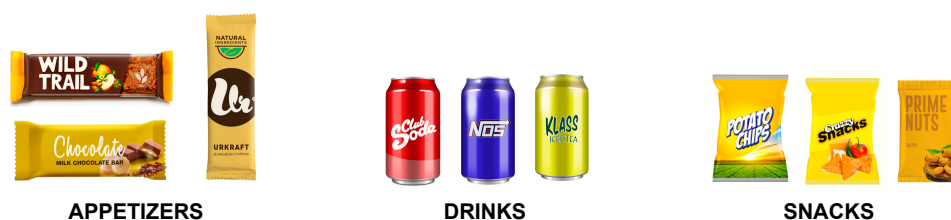
Figure 2. Stimuli used in Study 2.

Forty people (21 women and 19 men; age range: 18–25; M/SD = 22.8/2.3 ) were invited to participate in the study. The stimuli were nine food products belonging to three different categories: (1) soft drinks (ice tea, soda and energy drinks), (2) snacks (chips, nuts and nachos) and (3) appetizers (cookies, chocolate bars and cereal bars) (See Figure 2).