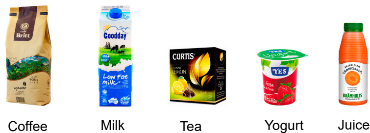
Figure 1. Stimuli used in Study 1.

The within-subjects experiment was based on the passive visualization of five different food packaging (coffee, tea, milk, yoghurt and juice) (See Figure 1). Product categories were selected among packages of everyday commodities and based on the following: (1) the analysis of products most often tested on previous studies [3], and (2) the results of a focus group discussion conducted with a sample of eight people aged 18–35 years. All packaging images were presented in full-color and had the same size and format. None of the brands and/or products tested in the present study used is marketed in Spain to avoid the familiarization bias.