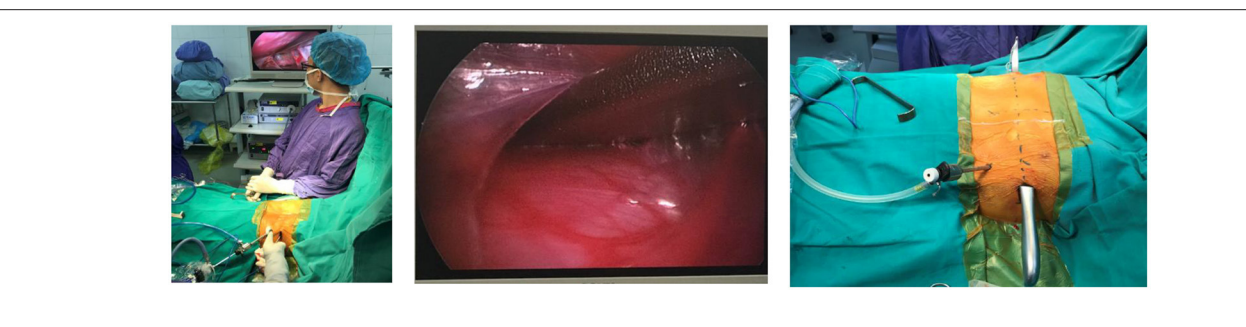
FIGURE 1 | Process of the created tunnel through mediastinum under the control of thoracoscopy.

through the anterior mediastinum in a direction going from right to left under the control of the thoracoscopy ( Figure 2 ). Then, the pectus bar was rotated to suit the patient's chest ( Figure 3 ).