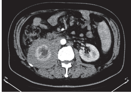
FIGURE 1: Preoperative computed tomography (CT) scan showing a right renal mass.