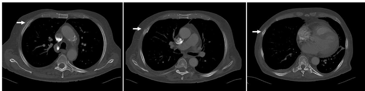
Figure 3 Same patient as in Figures 1 and 2. CT of the chest confirms the fractures of rib IV and V and reveals an additional fracture of rib VII.

The most common thoracic injury are rib fractures which can be found up to 67% of cases with blunt thorax trauma [9]. But rib fractures may also occur without an adequate thorax trauma. Typical risk groups are elder patients suffering from osteoporosis or patients with extreme sports activity such as rowing [10,11].