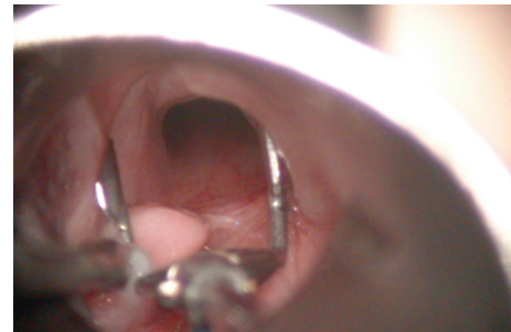
FIGURE 4: Laryngeal cleft demonstrated with the use of vocal cord spreader.

cutaneous haemangiomas in 11 children was published [6]. This was followed by 2 papers of propranolol therapy on subglottic haemangiomas [7, 8]. The mechanism of action is that propranolol induces apoptosis and decreases the production of endothelial vascular and fibroblastic growth factors (VEGFs and FGF \beta ). One of our patients, a 6-month-old girl, presented with extensive haemangioma involving the subglottis, posterior pharyngeal wall, and cervical esophagus. Tracheostomy was performed for the circumferential haemangioma. However, there was no sign of resolution or shrinkage of the haemangioma at the age of two. She was then put on propranolol therapy. The haemangioma was completely resolved after 6 months of treatment.