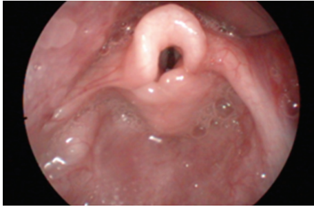
FIGURE 1: Endoscopic features of laryngomalacia.