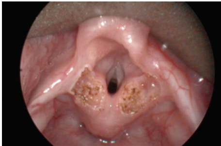
FIGURE 2: Laser aryepiglottoplasty under tubeless anaesthetic technique.

undergo injection laryngoplasty with hyaluronic acid or fat to medialise the palsied vocal cord.