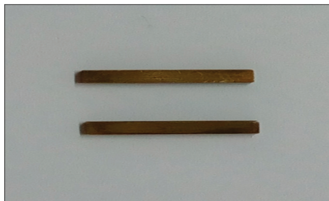
Figure 1: Brass die 2 mm × 2 mm × 10 mm

Once duplication was done, all the samples were verified for any casting defects and only those that were desired were selected for further experimentation. Formation of an oxidation layer was controlled in vacuum firing of ceramic furnace. Each sample's surface was sand blasted before ceramic layering with 110 µm aluminum oxide powder at a 45° angle and 20 cm distance from sample