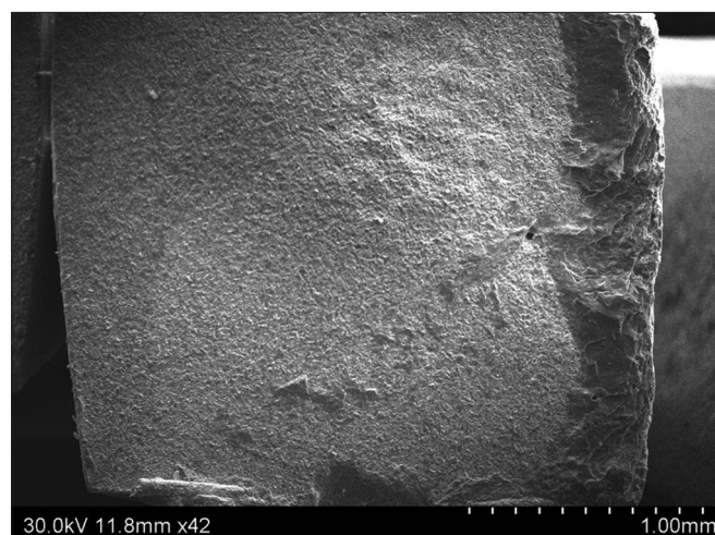
Figure 6: Scanning electron microscope image of Ti-ceramic specimen

The metallic titanium dental implant/prosthesis used in dentistry derives their biocompatibility from their alloying elements responsible for the formation of continuous stable \text{TiO}_2 passive film on its surface. Corrosion of this prosthesis occurs when oral conditions are unfavorable such as using them with inappropriate metal combination