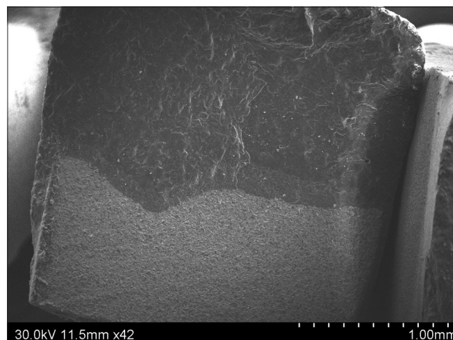
Figure 4: Scanning electron microscope image of cobalt-chromium ceramic specimen

speed of 1 mm/min. After ceramic layering, the SBS of each specimen was measured. The ultimate load (N) of each specimen was recorded. The SBS was calculated using the formula: SBS (MPa) = \text{load (N)} / \text{area (mm}^2\text{)} . ISO standardization was used to interpret the shear bond test results. As per the ISO standardization, a minimum value of 25 MPa is required for metal ceramic restoration. [7] The samples were further evaluated under scanning electron microscope (SEM) to evaluate the mode of fracture. The fractured surfaces were visually examined using an optical microscope at a \times 30 magnification (SMZ1000, Nikon, Tokyo, Japan) to evaluate the failure mode of specimens.