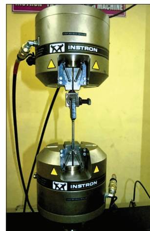
Figure 5: Universal testing machine