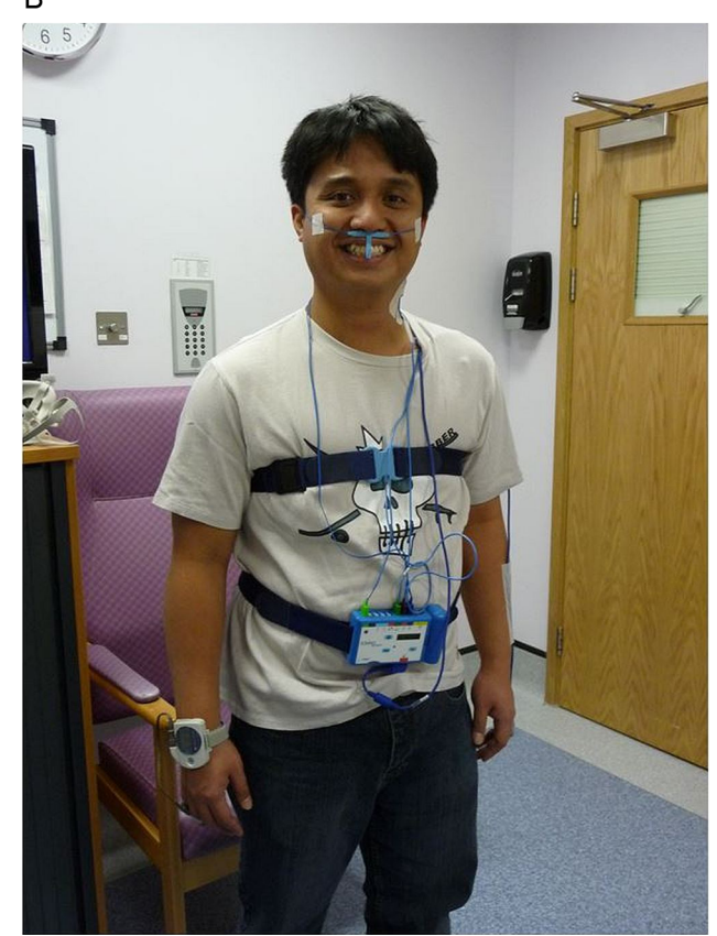
Figure 1 (A) wearable apnoea detection device (WADD) worn by one of the investigators. (B) Participant wearing an existing state of the art ambulatory apnoea monitoring system (SOMNO), comprising finger oximetry; oronasal flow sensors; thoracic and abdominal expansion bands; and ECG.