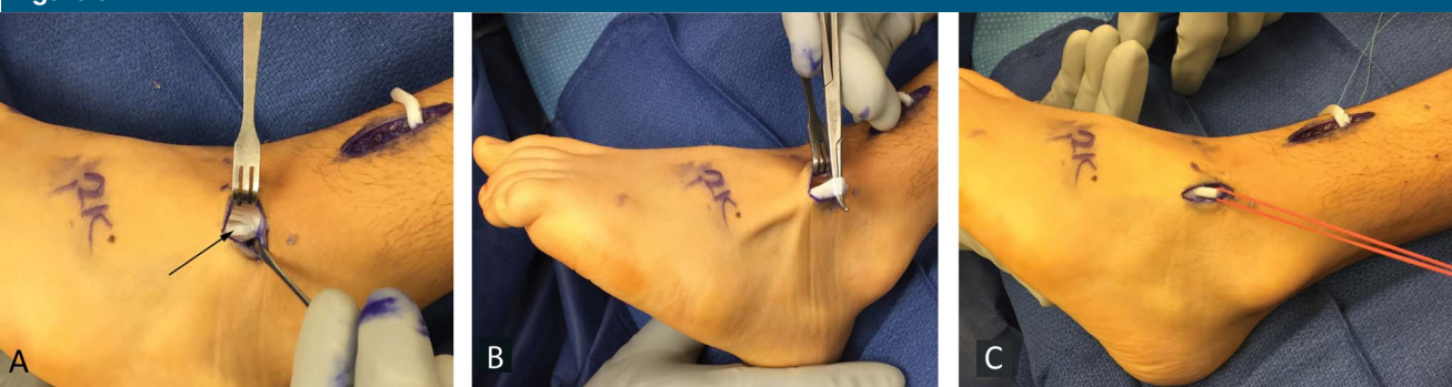
Photograph showing the peroneus tertius identification. A , Peroneus tertius located adjacent to fifth toe extensor (black arrow); ( B ) Pulling on peroneus tertius everts foot without moving the fifth toe, and the tendon course is seen distally; ( C ) Vessel loop placed around the tendon.