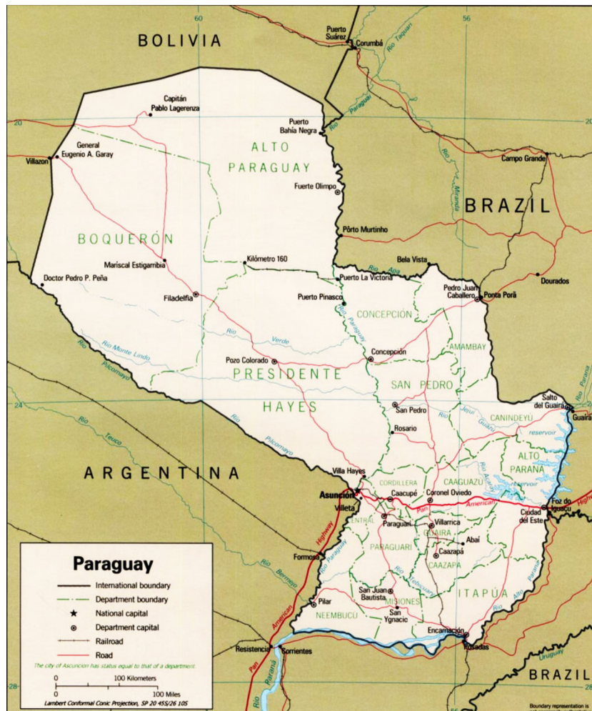
Figure 1. Political map of Paraguay

South-American native tribes inhabiting near the border with Paraguay (Benitez et al. 2002). The genetic distances as calculated by the method proposed by Edwards (1971) were closer between the Paraguayan and Spanish populations (0.494 et 0.415) than between the Paraguayans and Guaraníes (0.958), suggesting a Spanish genetic predominance in modern-day Paraguayan mestizos (Benitez et al. 2002). These results were reproduced in more recent experiments conducted by the same group (Benitez et al. 2011).