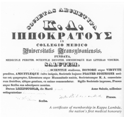
A certificate of membership in Kappa Lambda, the nation's first medical honorary

Chapters of K \Lambda were established in Philadelphia and New York City. Others were started in Baltimore, Washington, and possibly elsewhere, but little or nothing about them has been preserved. In Philadelphia, the chapter was called the "K \Lambda Society of Aesculapius," while in New York City it became the "K \Lambda Association of the United States." A medical society with lofty goals was desper-