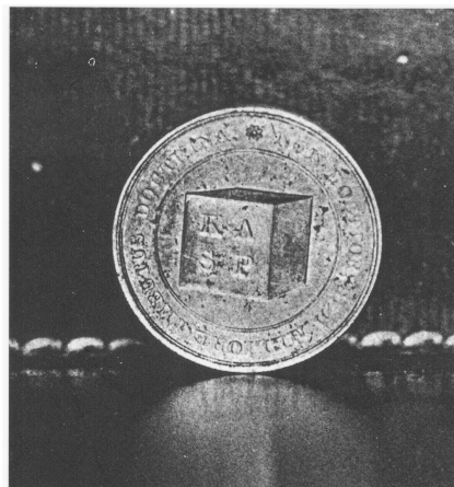
Figure 2. Left: Certificate of membership in the K \Lambda Society. Right: Brass seal of the K \Lambda Society.