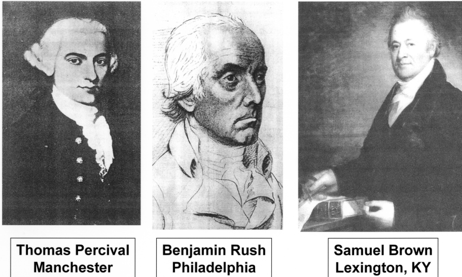
Figure 3. The harbingers of medical ethics and etiquette in the United States. Figure 3a (left) from Leake CD. Percival's Medical Ethics . Baltimore: The William and Wilkins Company; 1927. Figure 3b (center) from Corner GW. The Autobiography of Benjamin Rush . Princeton University Press; 1948 (used with permission). Figure 3c (right) used courtesy of Transylvania University.

City been destroyed by jealous, uninitiated physicians. Nonetheless, the society's influence would later be expressed in another organization, the AMA.