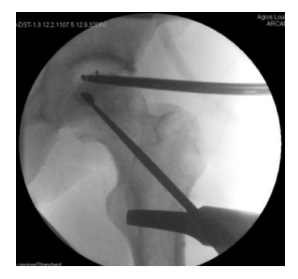
Figure 3. Arthroscopic assisted core decompression and curettage of the necrotic lesion.