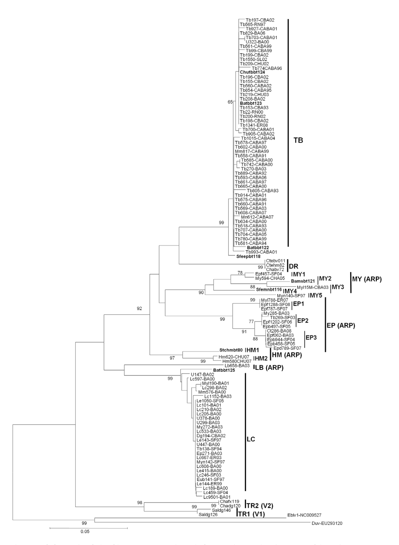
Figure 1. Phylogenetic relationships among Argentinean isolates. Analysis was based on 264 nt of the nucleoprotein gene. A tree was constructed based on Kimura and neighbor joining parameters. TB, Tadarida brasiliensis ; DR, Desmodus rotundus ; MY, Myotis spp. ; HM, Histiotus montanus ; EP, Eptesicus spp ; LB, Lasiurus blosseviilli ; LA, Lasiurus cinereus ; TR, Terrestrial. doi:10.1371/journal.pntd.0001635.g001