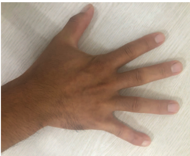
Figure 2. The similar Kirner deformity of the distal fifth finger for the patient's uncle.

According to the typical physical examination manifestations and imaging findings, we diagnosed it as Kirner's deformity of the fifth finger. We recommended that patients should be hospitalized for further operative treatment. We provided 2 operation