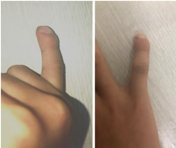
Figure 1. Photograph of the right hand shows volar-radial angular deformity of the distal phalanx of the fifth finger.

tations included the palmo-radial curvature of the distal phalanx of right little finger without significant tenderness. Radiograph showed volar-radial angular deformity of distal phalanges of her fifth finger, wider and thicker growth plate of distal phalanx in the form of L-physis (Fig. 3). Laboratory examinations showed no increase in leukocytes, erythrocyte sedimentation rate (ESR), and C-reactive protein, while MRI of fingers revealed slightly widened epiphyseal plate of the distal phalanx of the right little finger, L-shaped physis in epiphysis, and normally inserted flexor digitorum profundus tendon (Fig. 4). No abnormal or enhanced signal was spotted from soft tissues even after higher dose was administered.