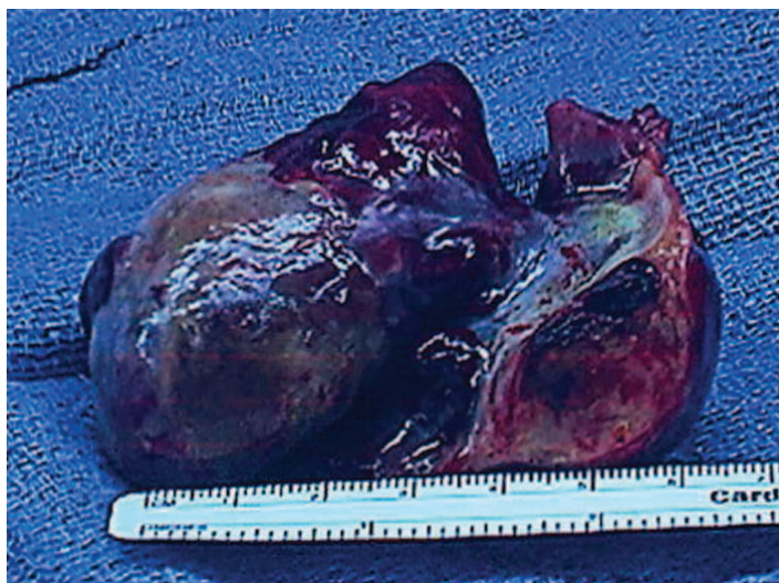
Figure 2. Gross aspect of the anterior portion of the angiosarcoma.

the liver. The differential diagnosis reported by radiology for this examination was hemangioma versus metastasis. The patient underwent surgery with radical resection of the right atrial wall tumor and reconstruction of the right atrial wall with a large piece of autogenous pericardium (Figure 2). After histopathologic evaluation, tumor features were found to be typical for cardiac angiosarcoma, spindle-cell type.