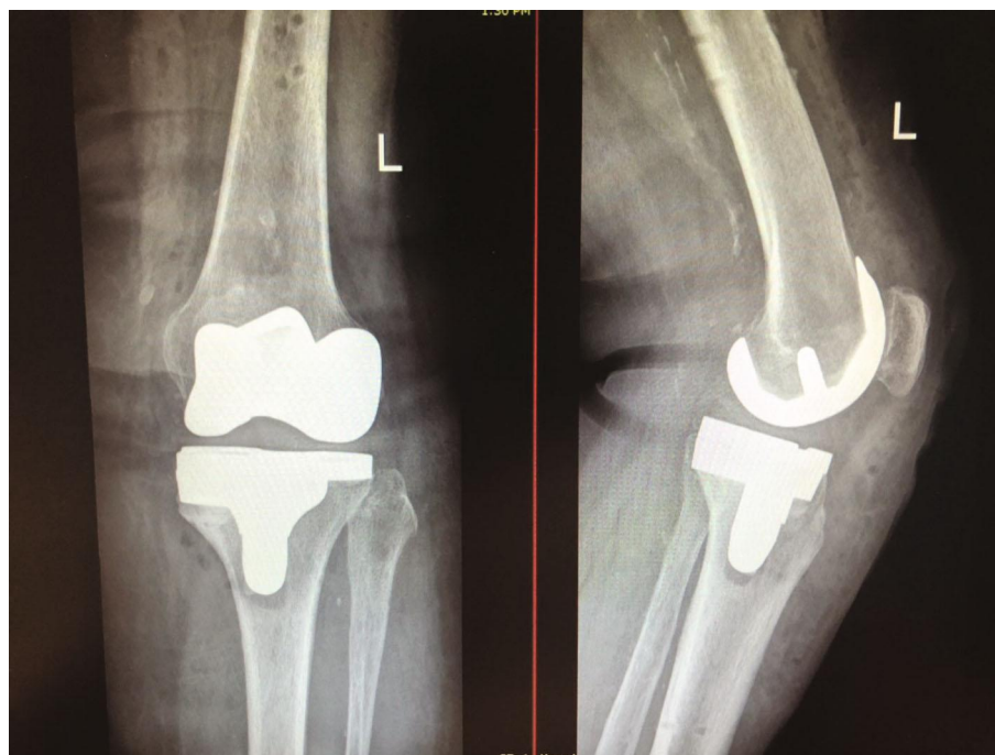
FIGURE 3: Postoperative anteroposterior and lateral X-ray views.

medial resection was 10.5 mm medial and lateral resection was 9.5 mm. Posterior Condylar Axis (PCA) was 1.8^{\circ} , while the transepicondylar axis (TEA) was 0^{\circ} . The system showed that the cuts' depth of the lateral compartment of the tibial plateau should be 7 mm.