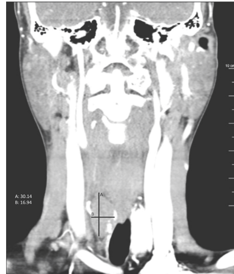
FIGURE 1: Coronal CT-neck with contrast demonstrates a 30.1 mm \times 16.9 mm right-sided parathyroid adenoma causing mass effect.

Grossly, the mass was described as a well-encapsulated dark pink-red soft tissue mass weighing 0.98 grams. Upon sectioning, a 1.8 \times 0.8 \times 0.6 cm well-circumscribed variegated tan-yellow to dark red focally softened nodule was present with all slices coming to within <0.1 cm of all margins. A rim of scant pink-tan grossly uninvolved soft tissue was located at the periphery. Microscopical sections revealed a well-demarcated nodule with encapsulated, cellular, homogenous cells composed of chief cells with some oxyphil cells in a delicate capillary network (Figure 3). There was a defined rim of normal parathyroid tissue with mostly central necrosis and thrombosed vessels. Immunohistochemical stain for parathyroid hormone was positive confirming the parathyroid nature of the mass. The patient's PTH did decrease to 26 pg/mL, and calcium remained within normal limits measured at 8.7 mg/dL.