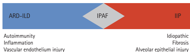
Figure 1. Schematic spectra of interstitial pneumonia with autoimmune feature (IPAF), idiopathic interstitial pneumonia (IIP), and autoimmune rheumatic disease-associated interstitial lung disease (ARD-ILD) and the representative features of IIP and ARD-ILD.

autoimmune-mediated inflammatory process (Fig. 1). Several genetic polymorphisms are known to be involved in the pathogenesis of ILD [36,37]. IPF-associated gene mutations are found in patients with telomerase-, surfactant protein-, immune function-, and mucin 5B ( MUC5B )-related conditions [37]. Newton et al. [38] demonstrated that the leukocyte telomere length is longer in patients with IPAF and ARD-ILD than in those with IPF. The leukocyte telomere length is associated with pulmonary function and lung transplant outcome in patients with IPAF [38]. Furthermore, MUC5B polymorphism is more common in patients with IPAF than in those with IPF, but the same is not true for Toll-interacting protein ( TOLLIP ) polymorphism [38]. These findings confirm that IPAF and IPF have similar ge-