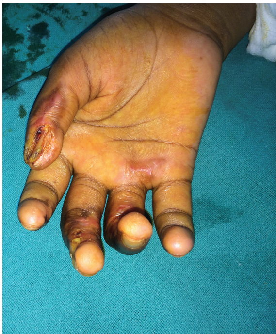
Fig. 3: Photograph shows healing second degree superficial burn of right hand in case 4.

to create calcium sulfate and then grinding it into a fine white powder. When water is added to the powder it quickly rehydrates and the slurry