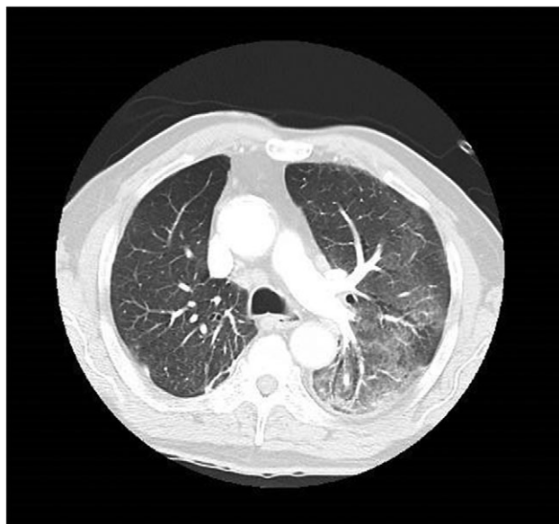
Figure 1: Representative computed tomography section at the pulmonary outflow tract level demonstrating non-specific ground glass infiltrate.

Follow up arterial blood gas in the upright position demonstrated an improved A-a gradient with normal saturation (Table 1). The patient reported immediate improvement in both dyspnoea and exercise tolerance and was discharged home. 1 month after discharge, he was able to walk 200–300 m without walking aid, and enlisted in community rehabilitation with good effect. Unfortunately, oncological surveillance demonstrated widespread skeletal metastasis and the patient died 7 months post procedure from progression of lung adenocarcinoma.