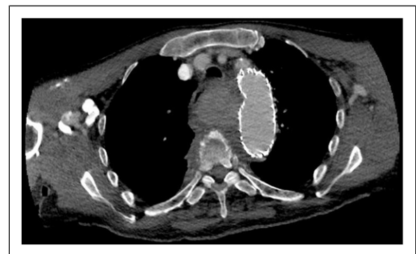
Figure 3. CTA scan showing progressive compression of the trachea and esophagus, stable aneurysm diameter (56 mm) and suspicion of a type 1b endoleak.