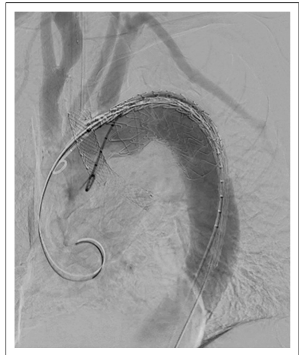
Figure 2. Completion angiography after TEVAR.

Tracheal compression due to vascular pathology is very rare and can be congenital, for example, double aortic arch, aberrant subclavian artery, or Kommerell's diverticulum, or acquired, for example, aneurysm or dissection of the aortic arch or descending thoracic aorta. 7,8 Literature regarding the treatment of tracheal compression is limited and most often