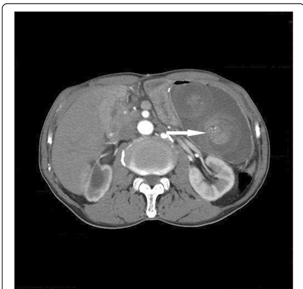
Fig. 1 Abdominal CT scan. The CT-scan reveals dilated stomach with bowel loops (Arrow: jejunogastric intussusception)

JGI can have varied clinical presentations such as abdominal pain, vomiting, intestinal obstruction, and hematemesis, which appear acutely. Approximately 50% of patients can also present with an abdominal mass [15–17]. Previous studies discussed a chronic form of JGI, which may mimic the acute form, but signs are