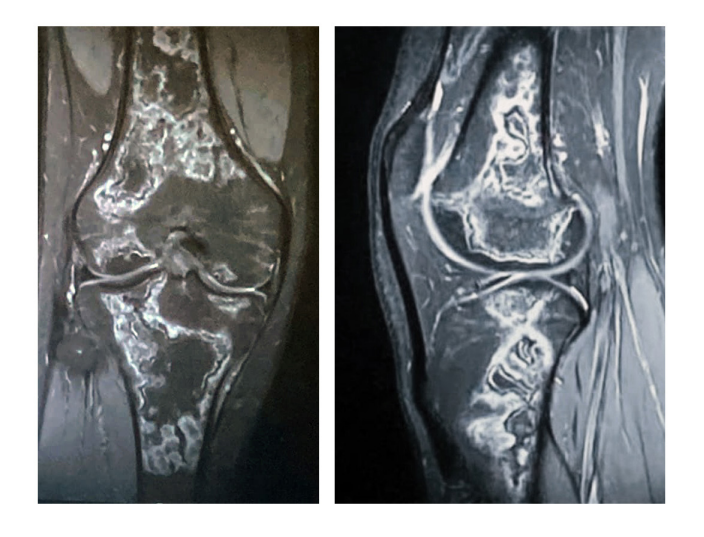
Figure 2 MRI of a male patient in his late teens confirming osteonecrosis of the right knee involving distal femur and proximal tibia.

Multiple classes of drugs have been studied for the management of moderate and severe COVID-19 infection. Among those, corticosteroids have been found to be life-saving in severe cases of COVID-19 infection.<sup>10</sup> However, they are also known to be an independent risk factor for the development of osteonecrosis. The pathogenesis of osteonecrosis is not entirely understood but is believed to be multifactorial. Vascular occlusion, fat cell hypertrophy, fat emboli, hypercoagulability and vascular endothelial dysfunction are some of the mechanisms postulated in the pathogenesis of osteonecrosis.<sup>11</sup> It is postulated that hypercoagulability, leucocyte aggregation and endothelial dysfunction, in addition to the use of corticosteroids in COVID-19 infection, can contribute to the development of osteonecrosis.<sup>12</sup>