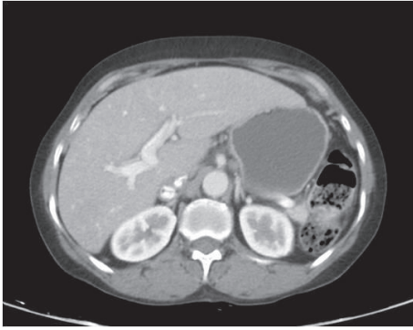
FIGURE 1: CT of abdomen showing hepatomegaly.