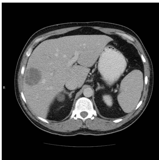
Figure 1 Computed tomography of the abdomen showing a mildly enhancing peripheral hypodense lesion in liver. Scan taken during the initial admission.

Because he was not improving, he underwent percutaneous aspiration of the liver lesion under ultrasound guidance after six days. This drained 30 ml of pus from our patient. Gram stain showed no organisms and culture was negative. He continued to have upper abdominal pain and high fever. A repeat abdominal CT scan showed persistence of the liver abscess, and a mildly dilated