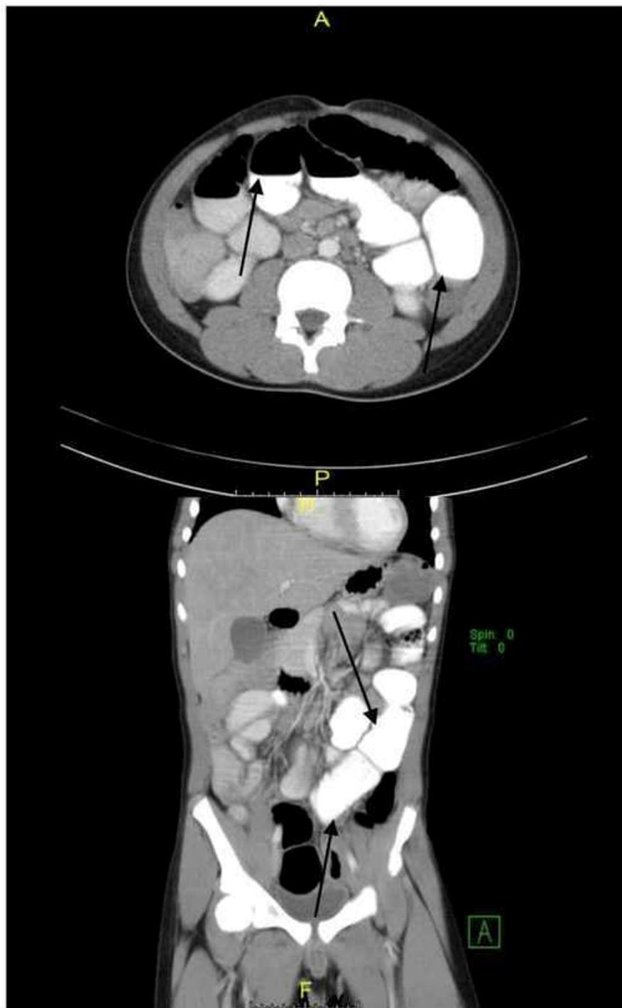
FIGURE 3: CT abdomen pelvis with contrast

The image shows mild dilation of the entirety of the jejunum and ileum without a transition point and which may represent an ileus. Contrast is present throughout the small bowel, as well as in the stomach, and has reached the colon indicating there is likely no mechanical obstruction (black arrows). Continued radiographic follow-up was recommended