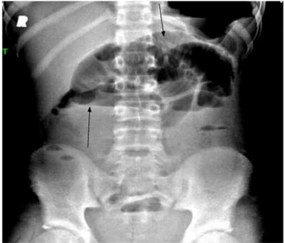
FIGURE 2: X-ray abdomen upright

The image shows an abnormal bowel gas pattern with multiple abnormally dilated and air-filled loops of SB (black arrows). Partial distal SBO cannot be excluded although alternatively there may be an ileus