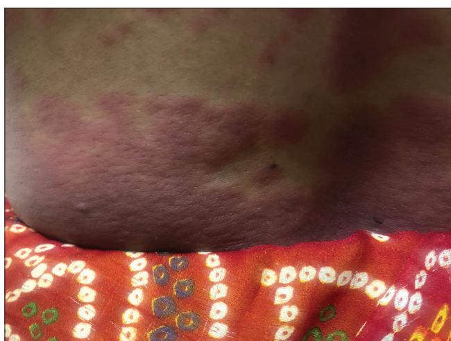
Figure 3: Pseudo-vesiculation over purpuric lesions

hydroxychloroquinone tablet 200 mg BD (twice a day), enoxaparin injection 4 mg s.c. (subcutaneous) BD for 2 weeks. Azithromycin tablet (500 mg) OD (once a day) was also given for 5 days. Oxygen support was given for breathlessness and inability to maintain the oxygen saturation (SpO 2 ). She was discharged after 17 days. The rash completely subsided in about 3 weeks from its appearance.