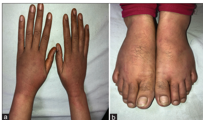
Figure 1: a and b: Erythema and edema of hands and feet including fingers and toes (COVID toes)