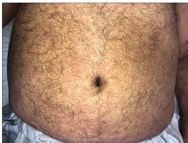
Figure 4: Urticarial wheals over abdomen in a COVID-19 patient

calamine lotion, and was relieved of his symptoms within 3 weeks.