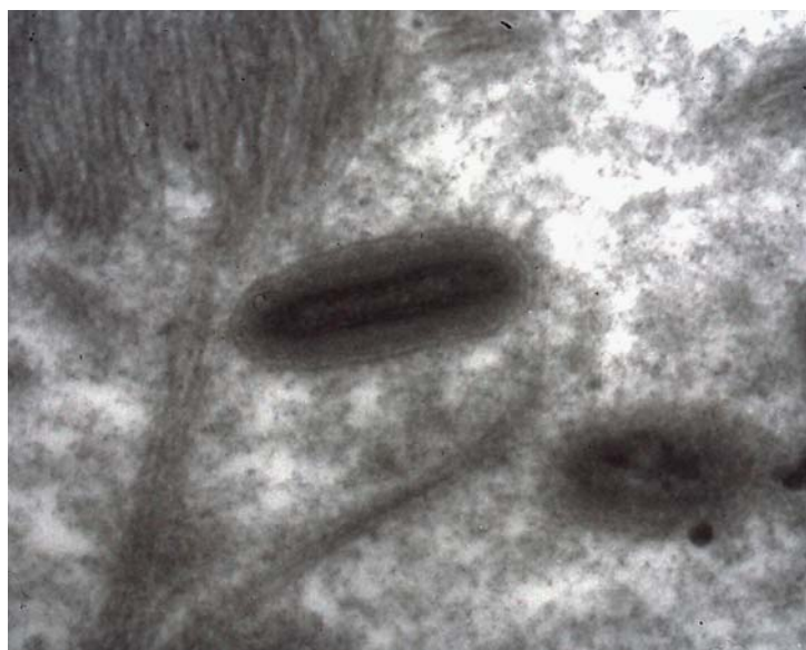
Fig. 3. Electron microscopy reveals intracytoplasmic viral particles with electron-dense cores.