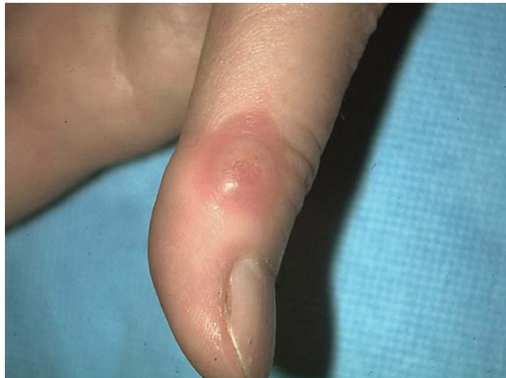
Fig. 1. One-centimeter, firm, erythematous papule involving the dorsal aspect of the right thumb of the 65-year-old female patient.

instances, the human disease occurs among sheep handlers and is transmitted by direct contact with the papulovesicular lesions or the crusts from an infected animal and only rarely through contact with meat or objects [8–10]. Although human-to-human transmission is extremely rare, some cases have been reported [11, 12].