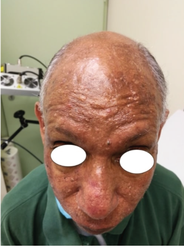
Figure 2. Subtotal clinical resolution after one week of combined topical and systemic antibiotic therapy.