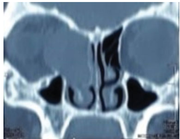
Fig. 3 Paranasal sinuses computed tomography coronal section depicting proptosis of the right eye resulting due to right ethmoid mucocele causing erosion of the right lamina papyracea.