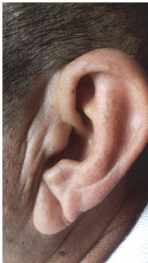
FIGURE 1: Diagonal earlobe crease in an Atahualpa resident.

Atahualpa residents aged \geq 60 years were invited to participate for evaluating the association between the presence and characteristics of ELC and results of ABI determinations, after adjusting for relevant confounders.