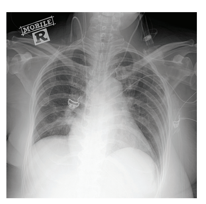
Figure 2. Chest radiograph showing resolution of cardiomegaly with marked improvement of pulmonary congestion by day nine of hospitalization.