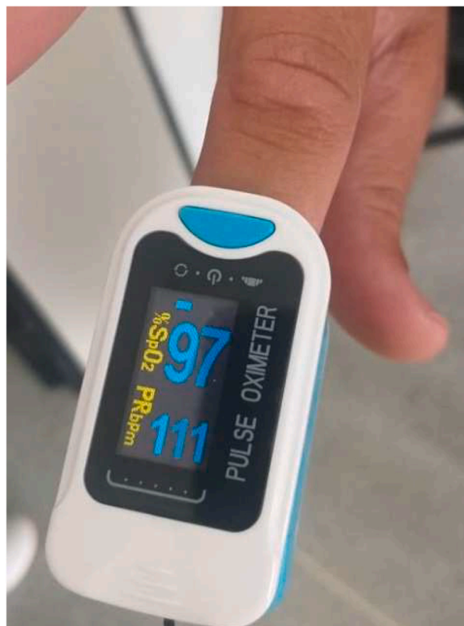
Fig. 1. Representative images of patient number 11, a diabetic, obese male patient, at first contact exhibited an oxygen saturation of 97% and was feeling well.

cases, oral prednisolone was prescribed at a loading dose of 1 mg/kg body weight for one day and 0.5 mg/kg body weight for an additional 4–5 days. A total of 68 patients were prescribed corticosteroids at home during the initial inflammatory phase of the disease, and four critically ill patients were prescribed corticosteroids at the hospital by assistant doctor (Table 3).