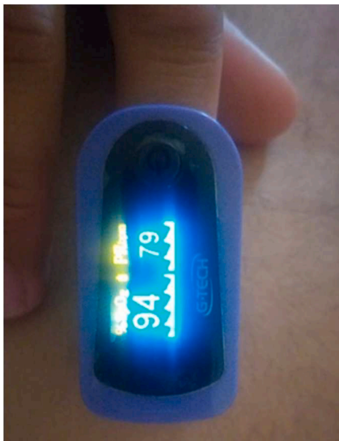
Fig. 2. Image of the same patient number 11 on day 9. His oxygen saturation level decreased to 94%. He was alerted to undergo treatment after confirmation of drop in oxygen saturation level.