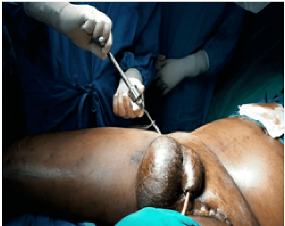
FIGURE 3: Fixation of iliac crest pins for pelvic external fixation system