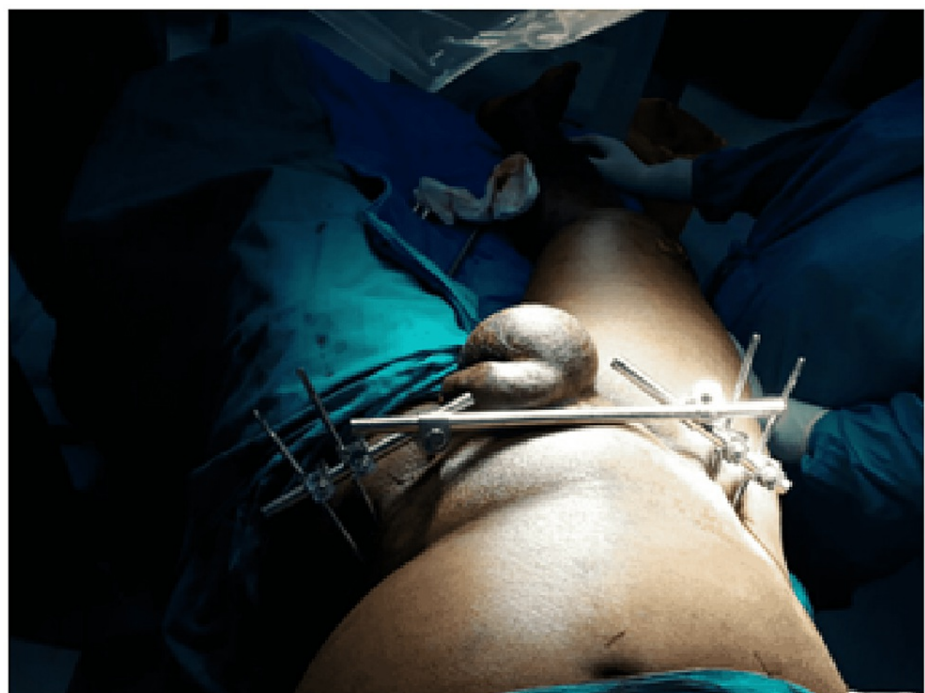
FIGURE 4: Fully fixed and stable pelvic external fixation system using iliac crest pins

Open approaches depended on the type and location of the fracture. We used the Anterior Suprapubic approach for pubic diastasis, the Posterior approach to the sacroiliac joint, Anterior approach for exposing iliac wings. Standard AO spring (recon) plate with standard screw and calculated screws for sacrum were used for surgery. All cases were operated on under spinal anesthesia.