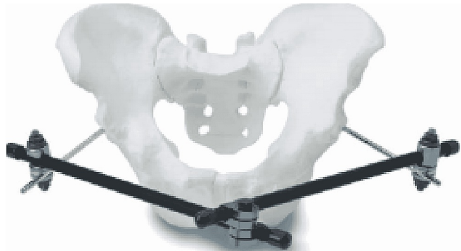
FIGURE 2: Supraacetabular pins

Illustrative images of the external fixator application are shown in Figures 3, 4.