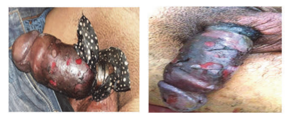
FIGURE 2: Condition of the penis before and after removing the ring.

appreciate the importance of the damage caused. It is a rare global phenomenon and a circumstantial pathology that most urologists encounter not more than once in their practice.