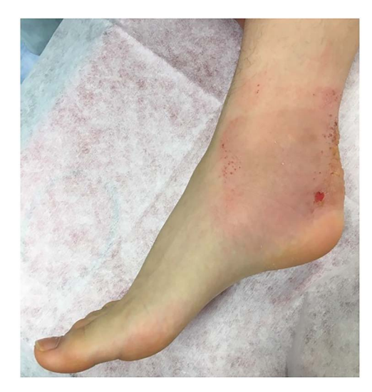
Figure 1. Right foot of the patient was in equinus position, and it was difficult to correct his foot position accurate due to his heel pain.