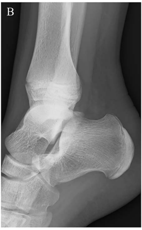
Figure 2. Plain radiographs of the right ankle showed no abnormal findings in (A) anteroposterior and (B) lateral views.

with conservative treatment including a non-weightbearing splint and intravenous antibiotics therapy using cefazolin (6000 mg per day). However, his symptoms and laboratory results did not improve at 4 days after starting intravenous antibiotics therapy, and so we applied hindfoot endoscopic bursectomy for him.