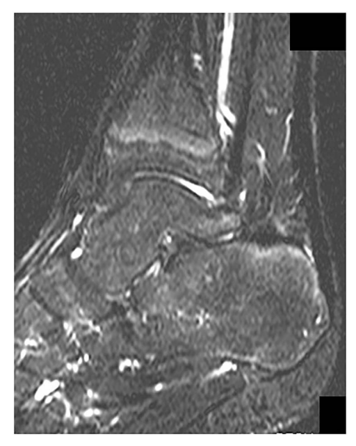
Figure 5. MRI revealed no abnormal signs on short TI inversion recovery images at 1 year postoperatively.

endoscopic bursectomy. This surgical technique may be a useful option in the treatment of septic RB.