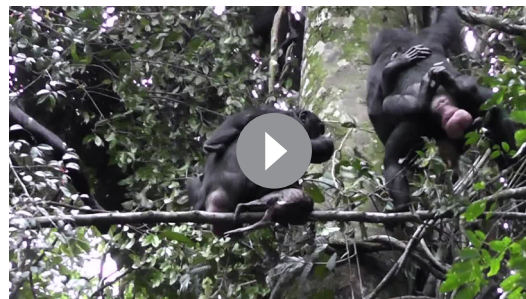
Video 1. Duiker and anomalure hunting by Kokolopori bonobos.

Observed differences in prey preferences may arise if different techniques are required to locate and capture them. Duiker and squirrel hunting are either strictly terrestrial (duiker) or arboreal (squirrel) activities, which appear opportunistic and commonly involved a single individual hunter (more so