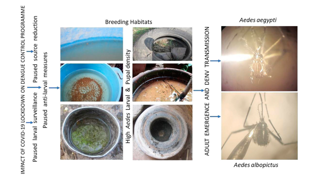
Figure 1. Figure shows the impact of COVID-19 lockdown on Aedes vector control programme. Aedes positive breeding containers and adult vectors emerged ( Ae. aegypti & Ae. albopictus ) from the collected samples are given.

The percent container positive was drastically increased after a month of implementation of lockdown (12.81% has increased). Ae. albopictus was recorded for the first time from Palace Guttahalli locality of Bengaluru City. The proportion percent of Ae. albopictus was 2.62% in K.P. Agrahara and 3.37% in Palace Guttahalli. Among the several containers surveyed, plastic drums were predominantly positive (29.7%) for Ae. aegypti larvae and pupae in both the localities (Figure 2). Similarly,