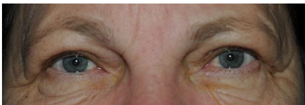
Figure 2 Slight periorbital edema, not inducing ptosis or dermatochalasis, no treatment necessary.

The periorbital edema is often mild, and does not require therapy. In severe cases, blepharoplasty can be performed and treatment with imatinib can be continued. 39 An alternative option for patients rejecting an operation would be a trial of conservative therapy with diuretics.