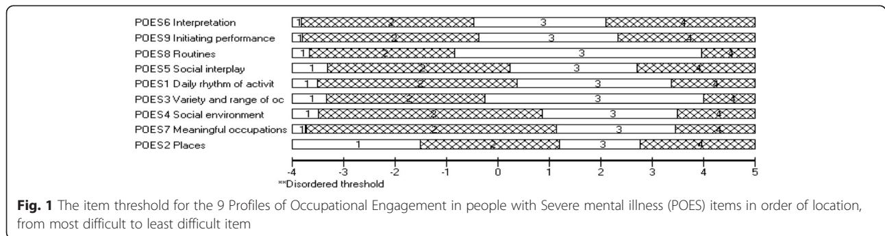
Fig. 1 The item threshold for the 9 Profiles of Occupational Engagement in people with Severe mental illness (POES) items in order of location, from most difficult to least difficult item

The local response dependency was accommodated by combining items 4, 5, and 6 into a testlet. This solution is useful from a measurement point of view, and satisfies the underlying theory of the POES scale as it keeps all of the items. The testlet can be further clarified in relation to the underlying assumption or theory of occupational engagement that forms the basis of the POES. The items 4 and 5 can be anticipated to represent the quantitative (item 4) and qualitative (item 5) aspects of social engagement and social functioning. Accordingly, these items fit together logically. The better a person is in communication and interaction skills (item 5), the more the person seeks out social environments (item 4). In terms of the interconnection between the socially-related items and item 6 (Interpretation), which represents a cognitive