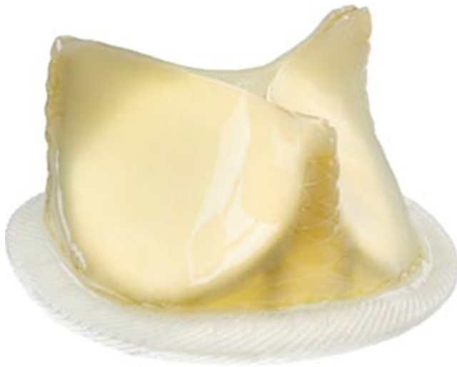
Figure 1 Trifecta valve. The valve consists of a polyester-covered titanium stent to the outside of which is sewn a single pericardial sheet folded to form three cusps.

by implanting the valve in a supra-annular position. Gradients at rest are low in the small label sizes between 19 and 23 mm (3, 4, 5). However, the reported effective orifice areas (EOA) vary widely, between 1.2 (6) and 1.6 cm 2 (4, 5) for the 19 mm size. One reason for this might be the use of different forms of the continuity equation to calculate EOA (1).