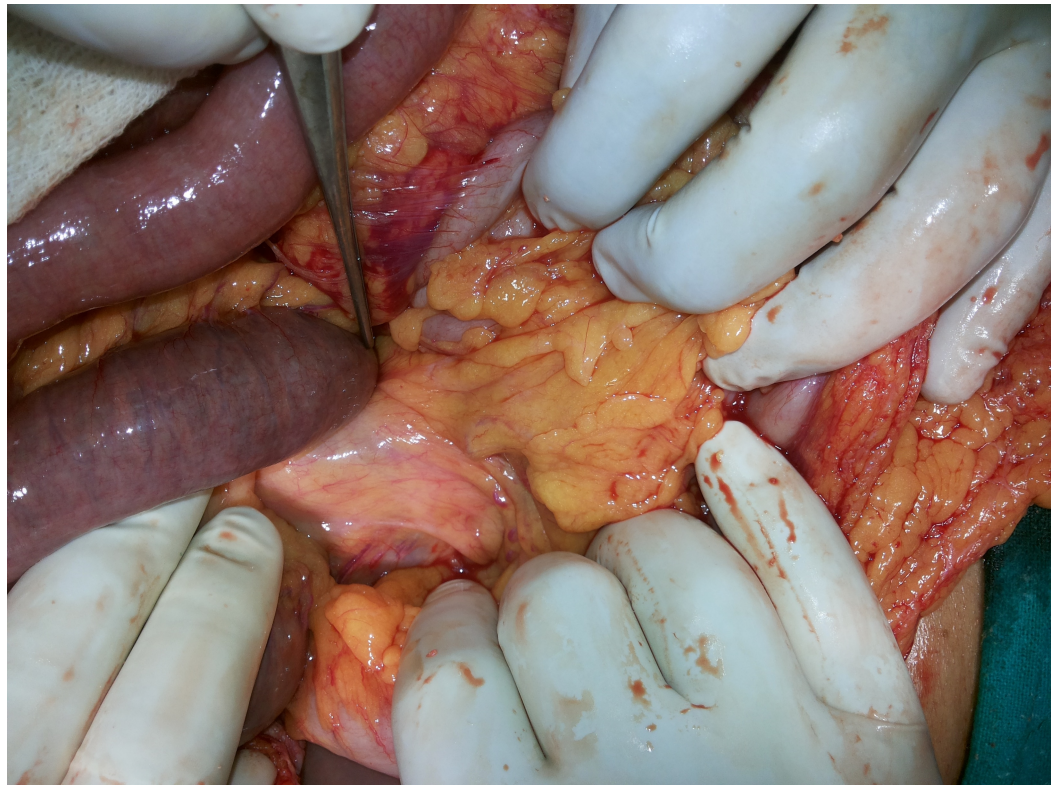
FIGURE 1: “Clockwise” twist of the ileum with instrument pointing at point of rotation

Mild distention of the stomach and proximal ileal loops was noted. The large bowel distal to the site of twisting was collapsed. No perforation or band was found. The volvulus was untwisted, and a line of rotation was seen. No fixation of the twisted segment was done. The bowel was slightly discoloured, but viable and started to return to its normal colour and shine (Figure 2).