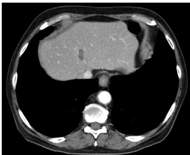
Figure 2 Region of thermoablation, liver segment 8.