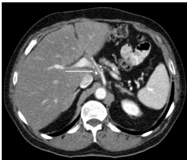
Figure 3 A stable disease of the gastric carcinoma surrounding the hepatic artery (arrow) could be detected after the 36 cycles chemotherapy (clips).

The antineoplastic agent taurolidine was intravenously applied in a 2% solution (Geistlich Pharma AG Wohlhusen, Switzerland) using a port catheter system. The monthly therapy (300 mg/kg/day according 24,9 g taurolidine/day) was given for 5 days in four hours' therapy sessions and 2 hours' intervals. Tumor markers (carcinoembryonal antigen-CEA, CA 72-4) were determined at the beginning and at the end of the therapies. Blood counts