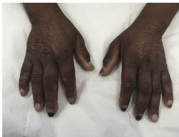
Fig 1. Hyperpigmentation of the distal nail plate with subungual debris involving multiple digits.

Further history revealed that he worked outdoors with his hands, but he denied any recent trauma. Our initial differential diagnosis at this time included hyperpigmented onychomycosis, trauma, bleeding diathesis, or endocarditis not visualized on transesophageal echocardiogram.