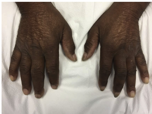
Fig 3. Follow-up visit with nail findings resolved.